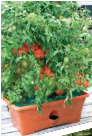
Vine Ripe Tomatoes

in a narrow strip on top of the soil. The plant roots will grow towards that fertilizer strip and automatically feed at their proper rate. Water from the built-in well will constantly move upwards towards the roots and keep them moist. Leave the cover on to protect the nutrient strip from rain and just add water to the well through the side spout as needed. It's that easy – follow these instructions and you'll never have to guess about when to add water or fertilizer again.